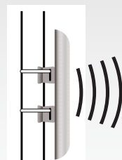
Pole Mount (Standard)