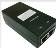
PoE Injector A