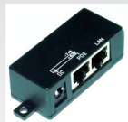
PoE Injector B