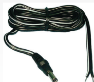
Power Cord B