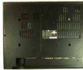
Meet VESA-75, 100 wall-mount standard