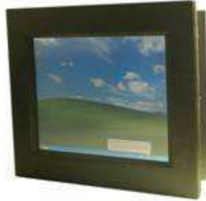
6 x USB, 6xCOM, 2 x LAN, VGA, 2 x Speakers, CF slot, PCI slot , MS, KB, Printer