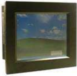
1.5GHz low power CPU, IP-65, NEMA-4 rating

12.1" Panel PC, low power 1.5GHz , Touch, support 1GB RAM, 2 x LAN, VGA, 8 x USB , 6 x COM, CF slot, PCI slot, CD-RW, 2 x Speakers, PS/2 KB and PS/2 Mouse, Printer